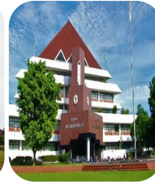
Bogor Agricultural University