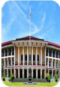
Gadjah Mada University

Consortium of Universities for DDIP Program