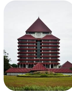
University of Indonesia